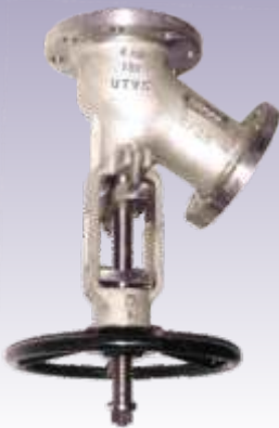
FLUSH BOTTOM VALVE FLANGED END