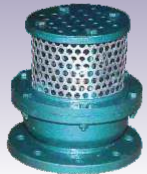
FOOT VALVE FLANGED END