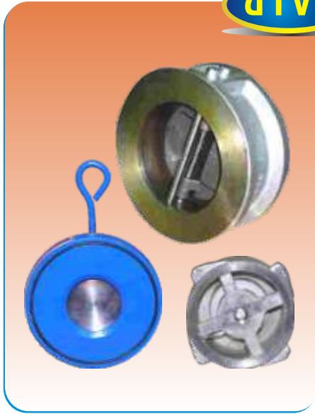
CHECK VALVE WAFER, DISC, DUAL PLATE TYPE