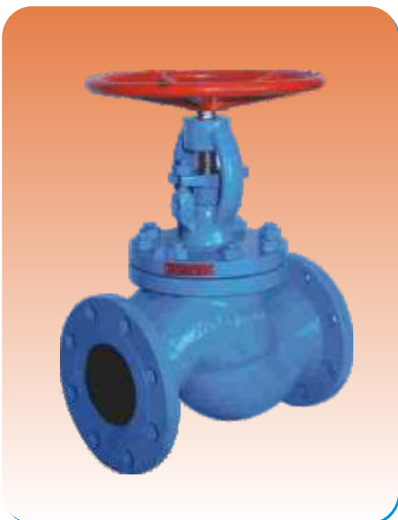
GLOBE VALVE CAST STEEL STEAM ND TYPE FLANGED END