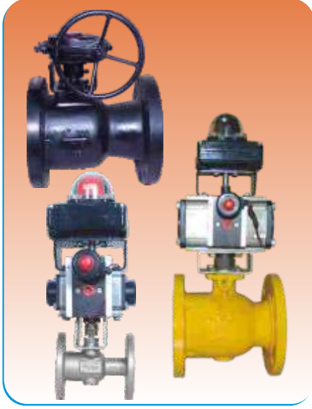
BALL VALVE FIRE SAFE ONE PC PNEUMATIC AND GEAR OPERATOR