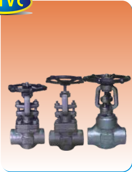
GATE GLOBE VALVE FORGED STEEL SOCKET WELD, BW, CLASS 800