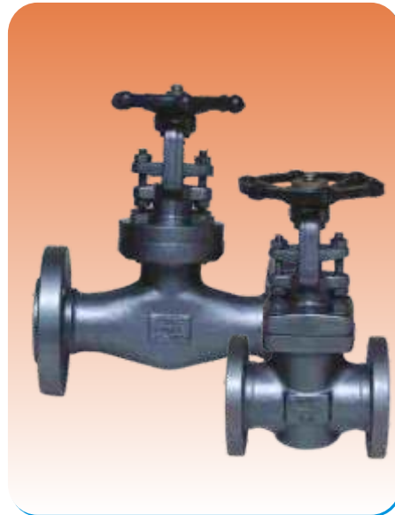
GATE VALVE FORGED STEEL FLANGED END