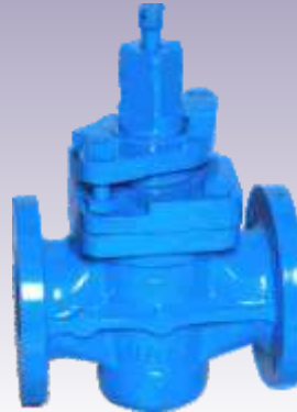
PLUG VALVE FLANGED END