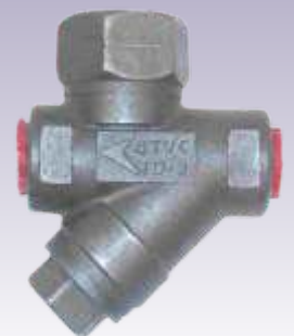
THERMODYNAMIC STEAM TRAP-TD3 BSPT