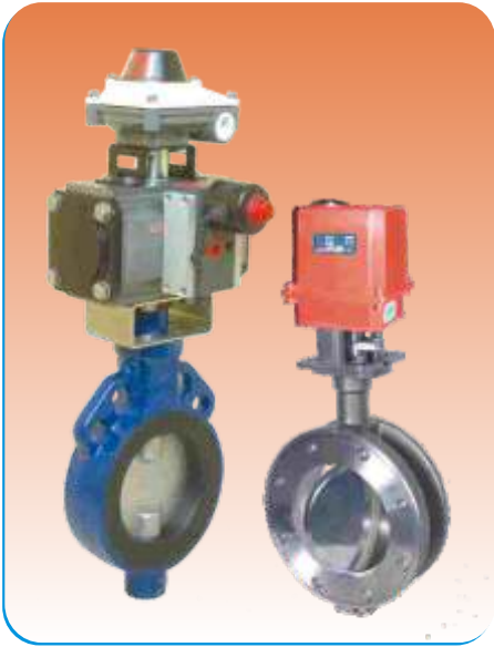
BUTTERFLY VALVE PNEUMATIC AND ELECTRICAL TYPE