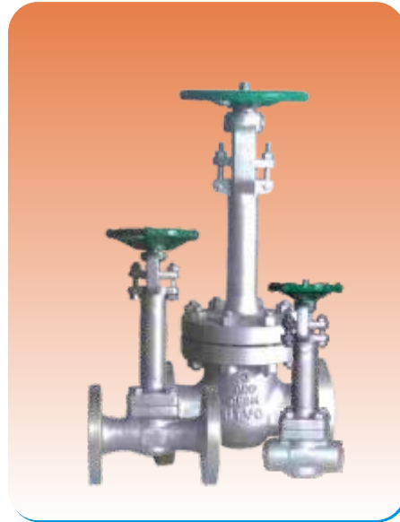
GATE VALVE CRYOGENIC EXTENSION SPINDLE TYPE FLANGED END