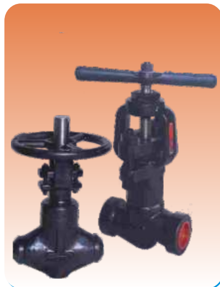
GLOBE AND GATE HIGH PRESSURE VALVE SOCKET & BUT WELD END