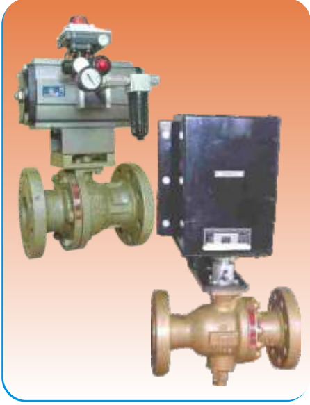
BALL VALVE FIRE SAFE TWO PC PNEUMATIC AND ELECTRICAL TYPE