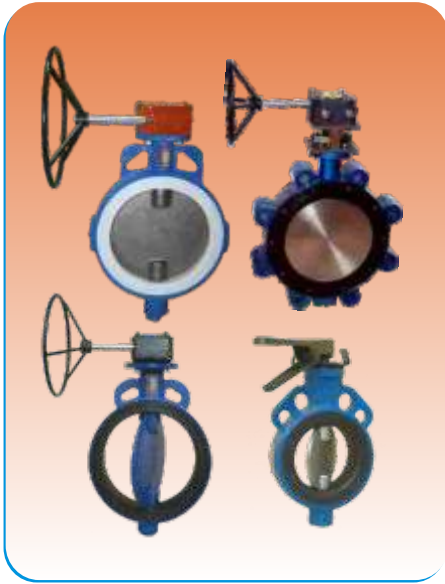
BUTTERFLY VALVE MANUAL AND GEAR OPERATOR