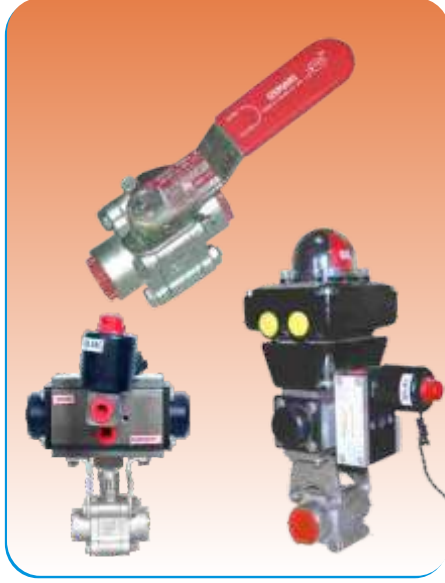
BALL VALVE THREE PC 800 SE PNEUMATIC AND LEVER OPERATOR