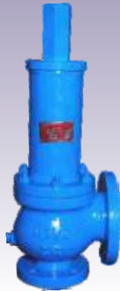
SAFETY RELIEF VALVE FLANGED END