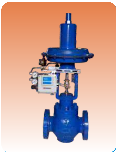
GLOBE PNEUMATIC CONTROL VALVE CAST STEEL ON/OFF FLANGED END