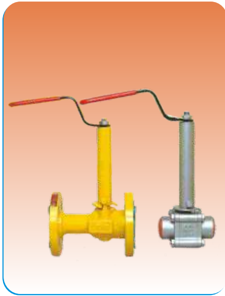
BALL VALVE THREE & ONE PC CRYOGENIC EXTENSION SPINDLE