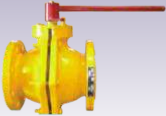
BALL VALVE TEFLON LINE