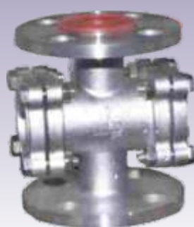
DOUBLE WINDOW SIGHT GLASS FLANGED END