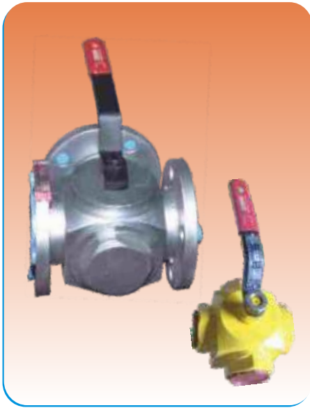
BALL VALVE THREE WAY L-T PORT FLANGED & SCREWED