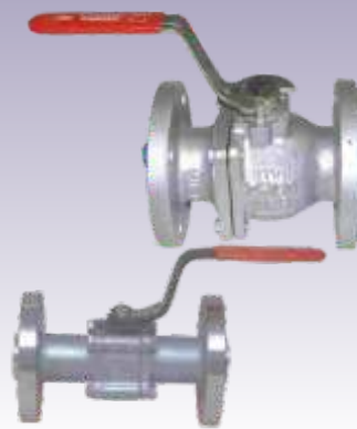
BALL VALVE TWO THREE PC FLANGED END