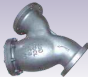
STRAINER Y TYPE FLANGED END