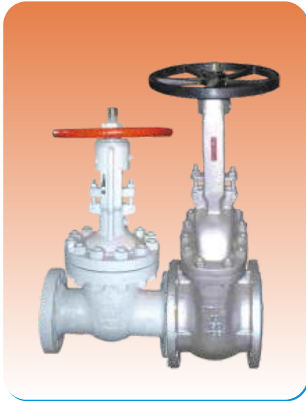
GATE VALVE CAST STEEL FLANGED END