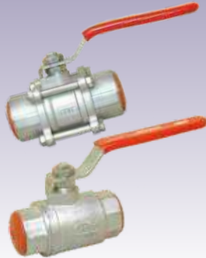
BALL VALVE ONE PC 1000 PSI WOG SCREWED