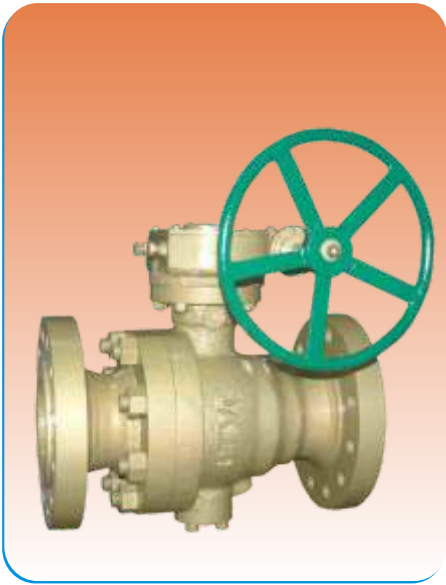
BALL VALVE FIRE SAFE TWO PC TRUNNION MOUNTED FLANGED