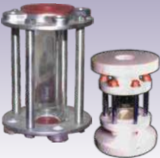
FULL VIEW SIGHT GLASS FLANGED END