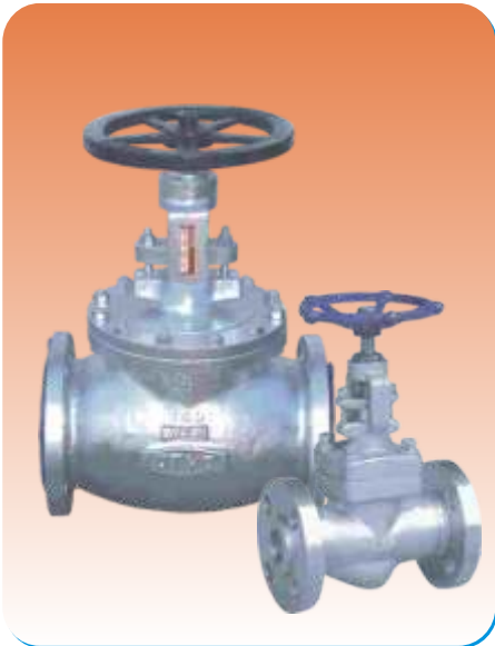
GLOBE VALVE CAST STEEL FLANGED END