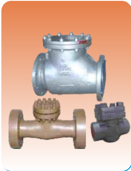
CHECK VALVE CAST STEEL, FORGED STEEL FLANGED & SOCKET WELD